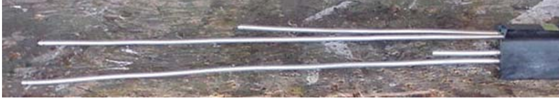
Alum brake and vent lines installed in fairing material

Insert the alum lines into the holes in the fairing material. One 6 foot long piece of tubing is to be inserted into the hole nearest the large, cupped edge of the fairing. The 6 ft long brake line tubes should stick out the bottom end of the fairing 12 inches and have approx 24 inches out the top end as shown above. The 1ft long tube is a forming aid only and should be inserted such that 2" extend out of the fairing material as shown.. The 4ft tube is the main tank vent tube and should be positioned with 12 inches exposed at top and 3 inches pulled out through hole as shown above. The fairing with the 4ft long tube in it is the right fairing and the one with the 1 ft. tube is the left fairing.