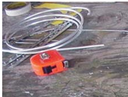
Alum brake line material

The fairing material is shipped in 2 forms. One approx. 6 foot long piece or cut into two approx 3 foot long pieces. If shipped in one long piece, cut into 2 equal length pieces.