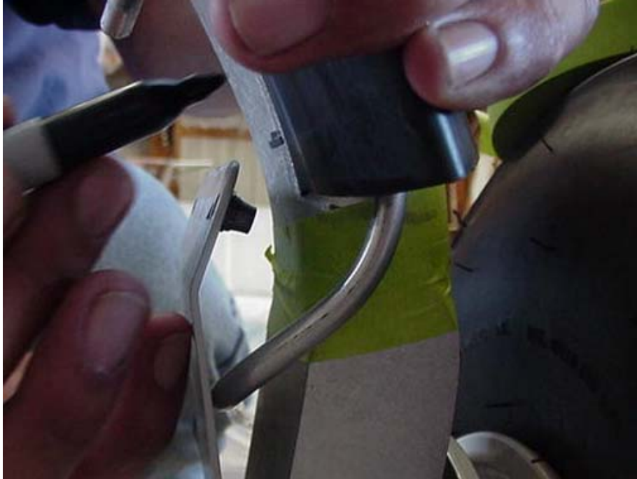
Marking vent line exit hole location 2" above pant