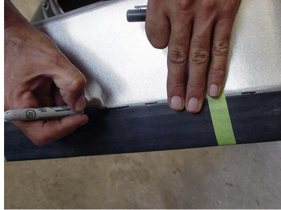
Fairing temporarily installed on gear spring with tape. Mark location on leg.