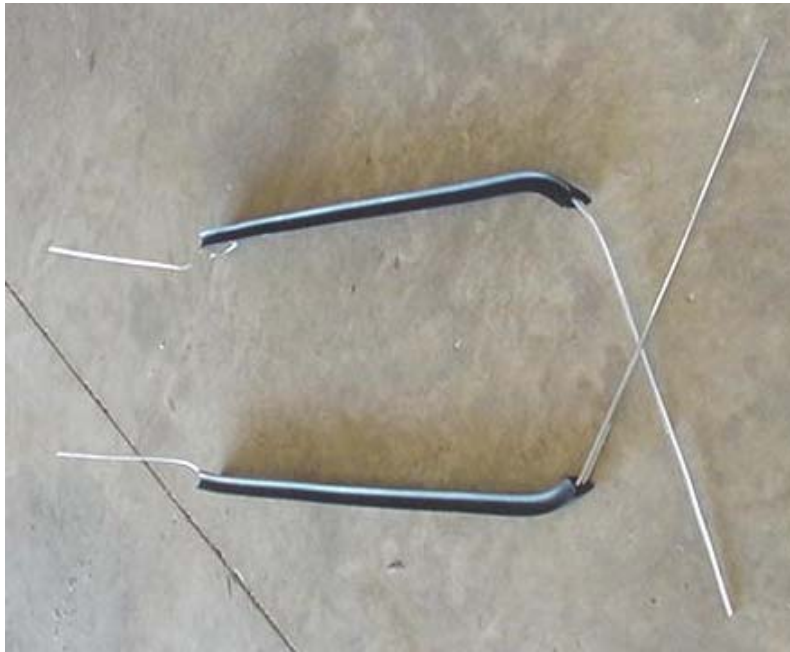
gear fairing shaped with brake and vent lines installed

The main gear spring on the Pitts Model 12 is streamlined with a rubber fairing bonded to the trailing edge. These instructions are for the installation of the fairing.