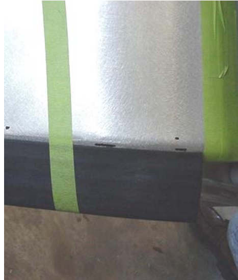
Lower end trim point even with top of wheel pant bracket. Upper trim point.

Trim fairing to length. Upper trim point is where the radius ends on the trailing edge. The point where the spring starts to transition to square edges. The lower trim point is even with the top of the wheel pant mount bracket. If brackets are not yet installed, install them temporarily for this measurement. Cut the fairing material with a band saw or similar tool. Recheck fit on main gear spring.