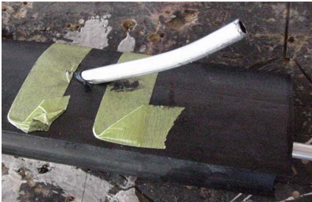
4ft long Main tank vent tube pulled through cut exit hole

Cut hole through rubber at rear inner hole at vent exit point. The hole is a slot so that the tube can exit on an angle as shown above. Use a die grinder or dremel type tool to cut this hole.