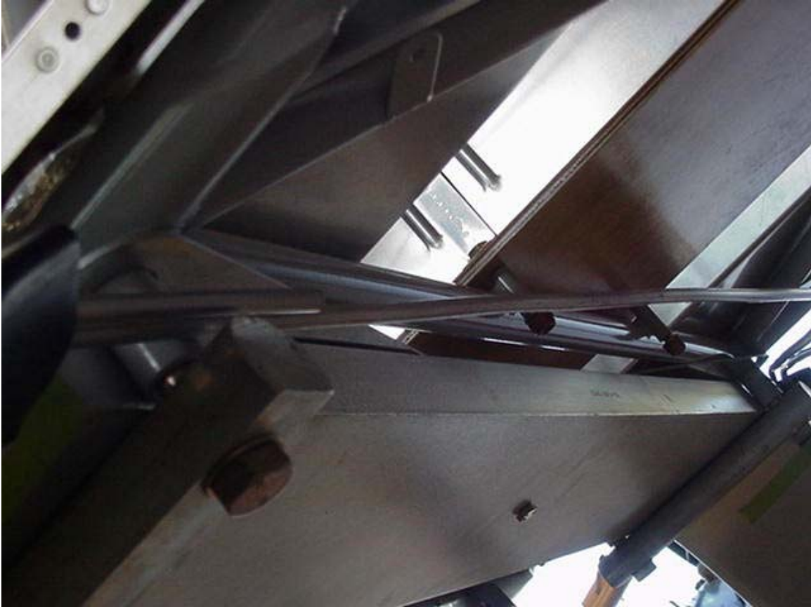
Upper end of lines

With the rubber temporarily taped in place on each leg, mark the top and bottom end locations on the leg for alignment when gluing in place.